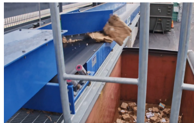
A chute leads the briquettes to a container outdoors.