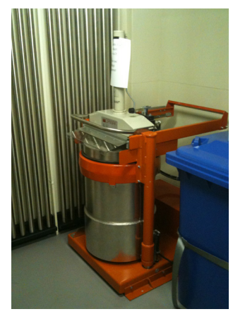
Lockable handle on the press unit