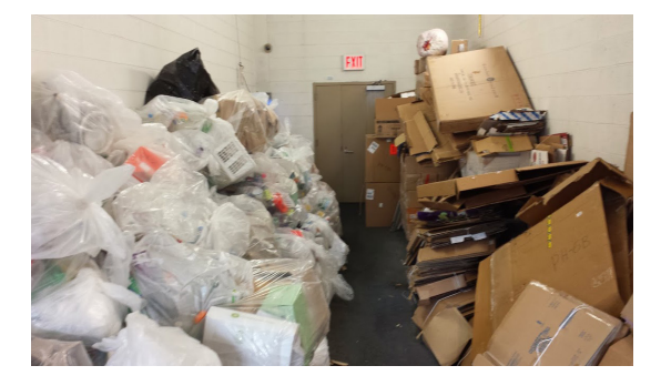
What To Do About All This Trash The Orion has 60 floors of apartments, which adds

Take cardboard recycling: Unlike single-family homes with curbside pickup, a large apartment building can accumulate hundreds of boxes each week, which can quickly overwhelm maintenance and storage areas. One building, The Orion, a luxury condominium on West 42nd Street in New York City, found a convenient, space-saving solution - compacting and baling cardboard boxes and plastic packaging using a multi-chamber cardboard baler.